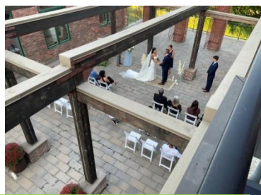
Wedding Romance on our Concourse