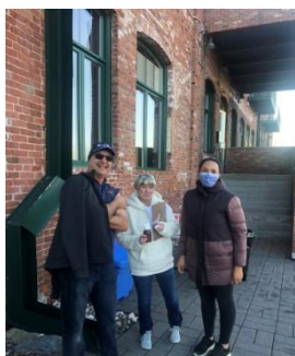
Flu Vaccine Clinic